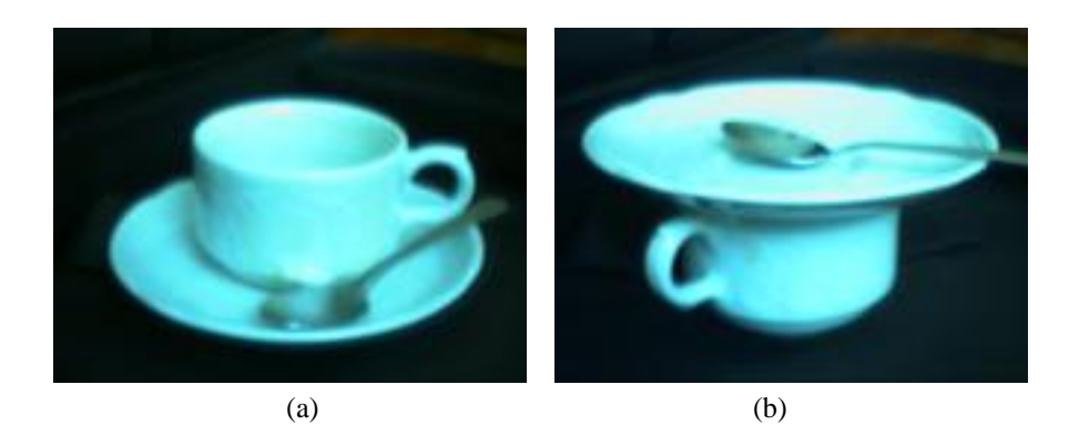
Figure 2: Most people see the 3-D scenes depicted here fairly clearly, though not with great precision, as the images are noisy and have low resolution (160x120 pixels – taken using a webcam in a hotel room with poor lighting). A normal adult looking at the pictures can easily visualise a sequence of actions that would transform the configuration on the left to the configuration shown on the right, and vice versa, though not with perfect precision. Despite what humans can do with such images, it is still the case that seeing the 3-D spatial structure and the affordances in such images is beyond the capabilities of current vision systems. If humans can see a lot of structure in such static, monocular, monochrome images, that demonstrates that the problems do not require use of higher quality cameras, colour vision, motion or stereo. Something deeper than better technology is required.

There has been a considerable amount of work on visual acquisition of information about surface structure, e.g. using laser range finders. The capabilities of such systems are often demonstrated by projection of images from new viewpoints. But those vision systems show little or no understanding of 3-D structure and its relevance to action (e.g. through understanding affordances [7]). For example such systems don't understand how features like curvature, orientation, hardness, smoothness, graspability, vary from one part of the surface of an object to others. (Apologies to anyone whose work is an exception – it has been hard to find!)