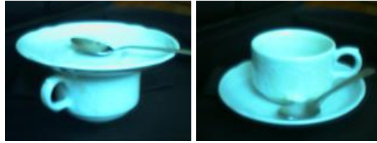
Fig. 3. Consider one or more sequences of actions that would enable a person or robot to change the physical configuration depicted on the left into the one depicted on the right – not necessarily in exactly the same locations as the objects depicted. Then do the same for the actions required to transform the right configuration to the left one.

about all this is that although you do not normally think of using mathematics for tasks like this, if you choose a location at which to grasp the cup using finger and thumb of your left hand, that will mathematically constrain the 3-D orientation of the gap between between finger and thumb, if you don't want the cup to be rotated by the fact of bringing finger and thumb together. A human can think about the possible movements and the orientations required, and why those orientations are required, without actually performing the action, and can answer questions about why certain actions will fail, again without doing anything.