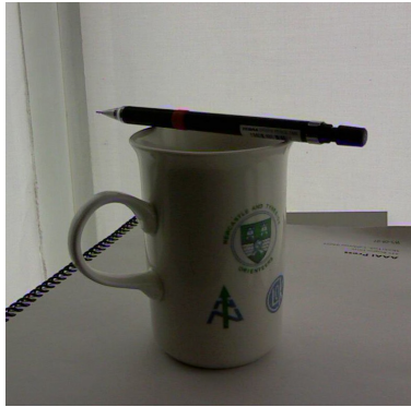
Fig. 2. Suppose you wanted to use one hand to lift the mug to a nearby table without any part of your skin coming into contact with the mug, and without moving the book on which the mug is resting, what could you do, using only one hand?

It is very unlikely that you have previously encountered and solved the problem posed below the following image, yet many people very quickly think of a solution.